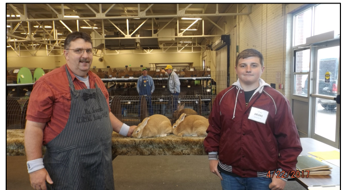
YOUTH: Best of Breed and Best Opposite