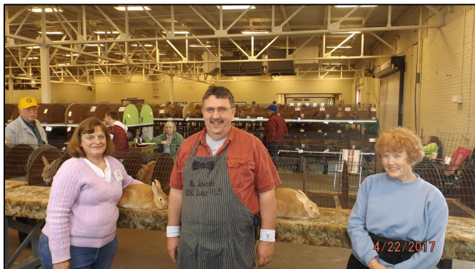
OPEN: Best Opposite and Best of Breed