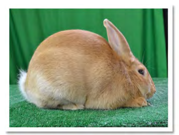
BEST OF BREED GOLDEN INTERMEDIATE BUCK BIS GROUP 2 WINNER MIKE RAAB, IN